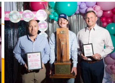
SMALL BUSINESS DIVISION ATMOS ENERGY