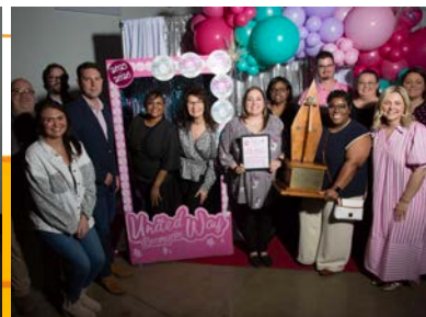
MEDIUM BUSINESS DIVISION HOPKINSVILLE ELECTRIC SYSTEM