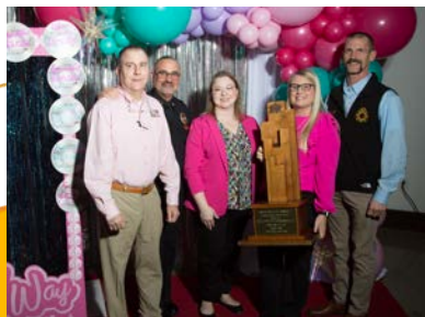
LARGE BUSINESS DIVISION THE CITY OF HOPKINSVILLE