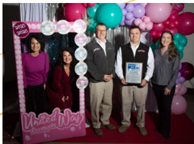
OVERALL BUSINESS DIVISION H&R AGRI-POWER